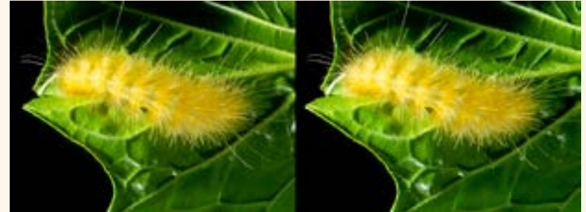
Yellow Caterpillar

The 3D Division (3DD) was formerly the Stereo Division officially begun in 1951. The name was changed in 2010. Stereo photography involves making two similar images (left and right) from horizontally separated camera locations, and became popular early in the 1800s. The Division recognizes over 25 International Exhibitions. 3DD has operated study groups, personal image evaluation, and instructive programs since its beginning.