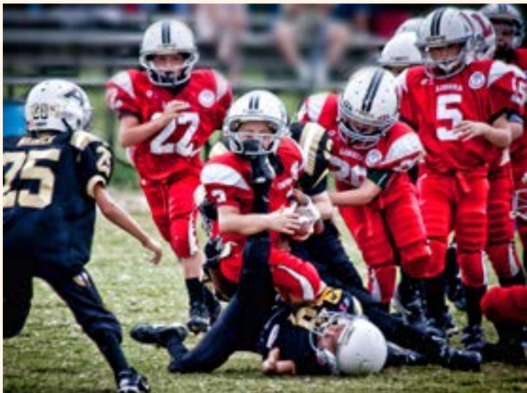
Foot to Face

PJD conducts several digital image study groups, the quarterly competition, photo story competition, a thematic exhibition, and a photojournalist of the year competition—all for individuals. It also conducts Interclub competitions four times each year.