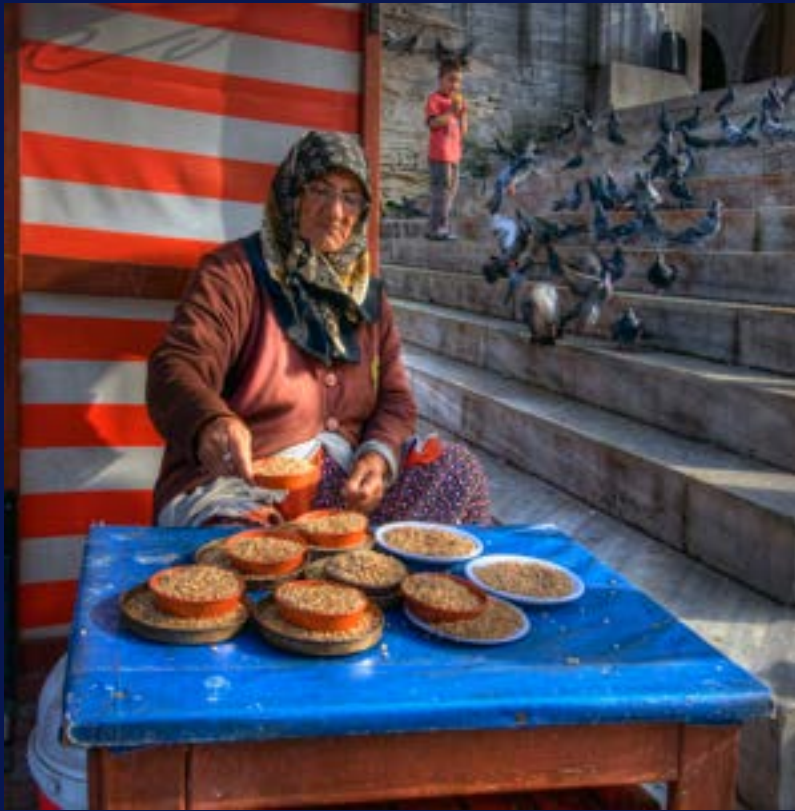
Seed Seller

All PSA members are urged to participate in one or more of the six Divisions to enjoy the camaraderie and fellowship of photographers with similar interests. The officers and activity directors of each Division may be contacted through the PSA website: www.PSA-photo.org . One may go to the page of a specific Division and click on a name or position to readily send an email to the desired individual.