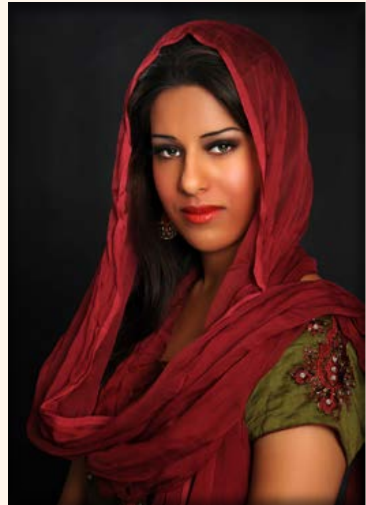
My Favorite Outfit

There are no limitations on subject matter or techniques used for image capture or post processing within print international exhibitions or division activities. PPD has four star tracks (sections) within international exhibitions: large and small open prints, and large and small monochrome prints. In PPD study groups of 8-10 people are called Portfolios . There are general Portfolios and Portrait Portfolios in North America. The Pictorial Print of the Month competition is a popular activity which originated as a Society activity but is now managed by the Division. The winning print appears in the monthly PSA Journal . PPD runs interclub competitions four times a year, and the division provides judging services for clubs as requested.