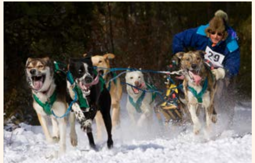
Husky Racer 29.

For individuals the Division conducts creative and portrait competitions, a photo essay competition, as well as the Image of the Year competition. Two digital-only Interclub competitions are held four times each year—one open to all