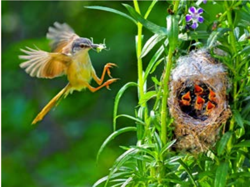
Feeding Tawny-flanked Prinias

The Nature Division (ND) was established in 1940, and by 1952 there were numerous nature study groups for wildflowers, birds, insects and other natural subjects. The Division has long provided identification services to help with technical names of subjects as well as personal evaluation services for all PSA members. The Division recognizes over 170 international exhibitions. The concept of presenting the Nature Story in photography has become increasingly important through the years.