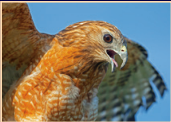
Red-Shouldered Close-up