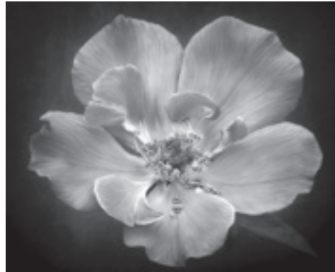
Big Flower