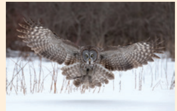
Great Gray Owl Landing