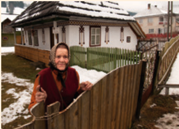
Winter in Romania

PSA provides an opportunity to meet people from around the globe. PSA enables making life-long friends who share common interests and who can meet at the annual week-long conference in exciting photographic locations.