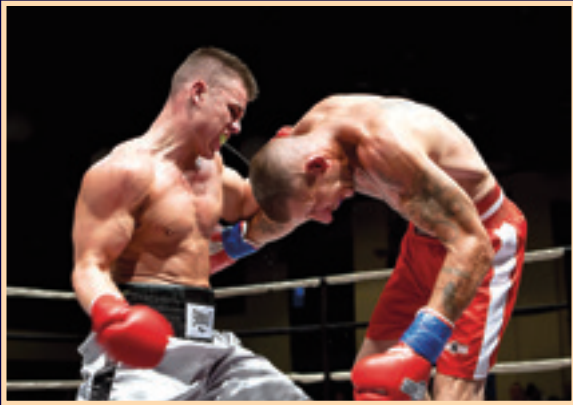
Spit in Your Ear