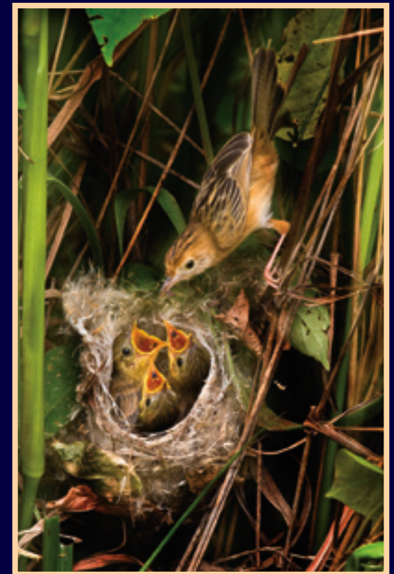
Lunch for My Three Kids