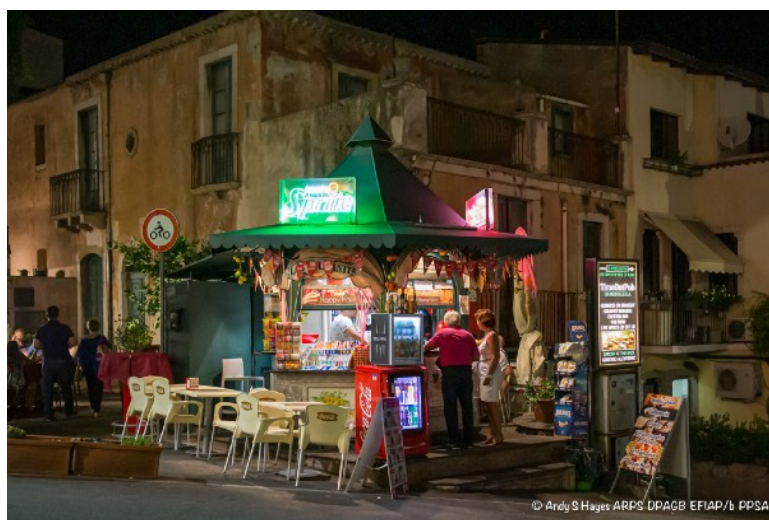
Taormina Street vendor

https://psa-photo.org/index.php?divisions-photo-travel