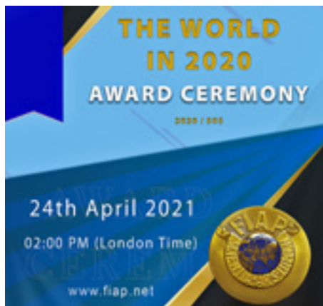
The World in 2020 Award Ceremony Poster

President, Photographic Alliance of America • FIAP Liaison Officer for the United States of America