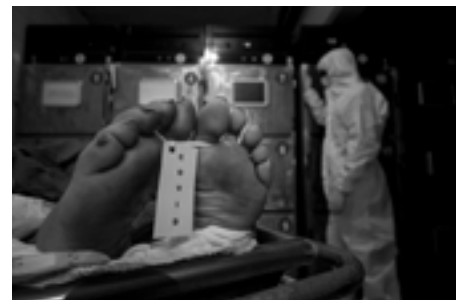
Sonuc

announcing that there will be two FIAP Patronage competitions held in 2021. Neither competition will have a fee. The first will be for images of UNESCO sites around the world, and the second will be for Wildlife images