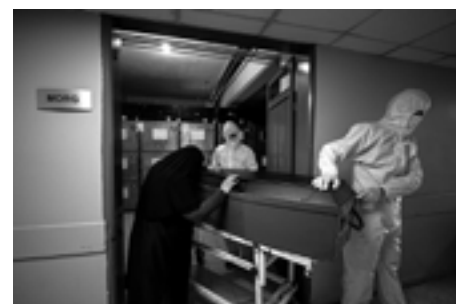
Yok Olus (Extinction)