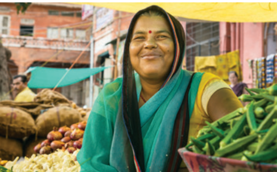
This close-up image of a person includes details about her environment/location and as such, adheres to the PT definition.

The Photo Travel Division was founded in 1972. Its purpose was to have a reality division which would promote images of our world and of its people as they appear naturally. PT images should reflect what we find, as we find it. It is about showing images reflecting the wonders of human achievement and the beauty of people around the world.