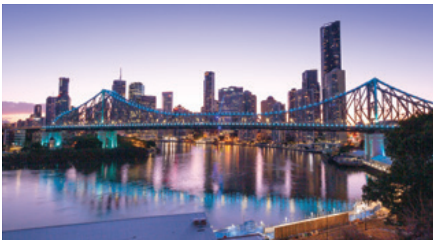
The above image clearly shows characteristic features which would be identifiable if one were to visit this scene. This image adheres to the PT definition.

must look natural and they are allowed because the PT definition states: restoration of the appearance of the original scene.