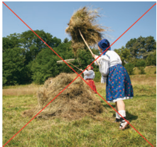
The above image portrays the culture of a land. There does not need to be any identifiable features in the image. The scene is exactly as the maker saw it and is a true depiction of a culture, a way of life, in this land.