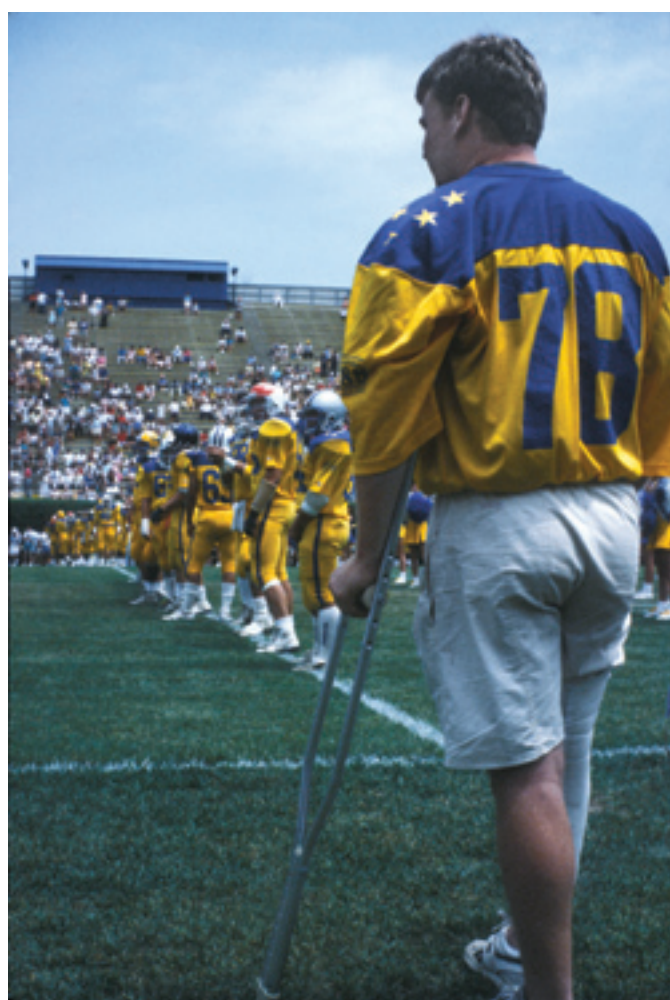
One team member is unable to play due to injury