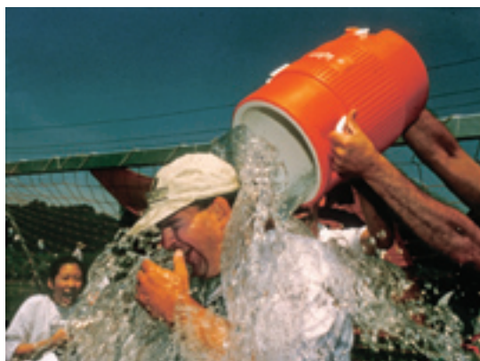
Dousing the winning coach delights a spectator