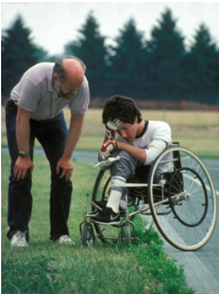
A disappointed wheelchair racer is encouraged by his coach