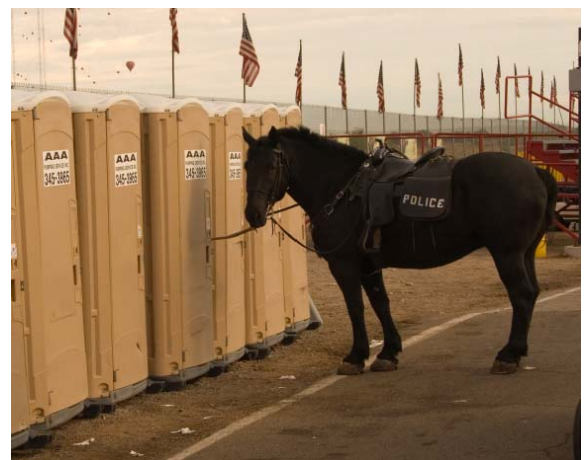
HORSE IN FRONT OF SATELLITES by Larry Swistoski - HM in Photojournalism