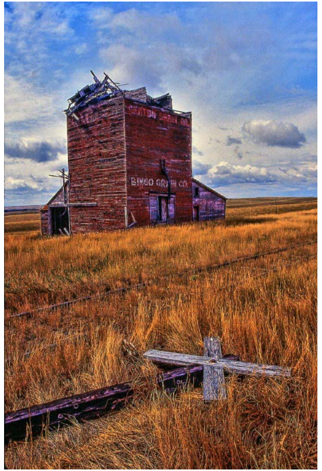
Bingo Grain Co #3 (Morris Gildmeister)