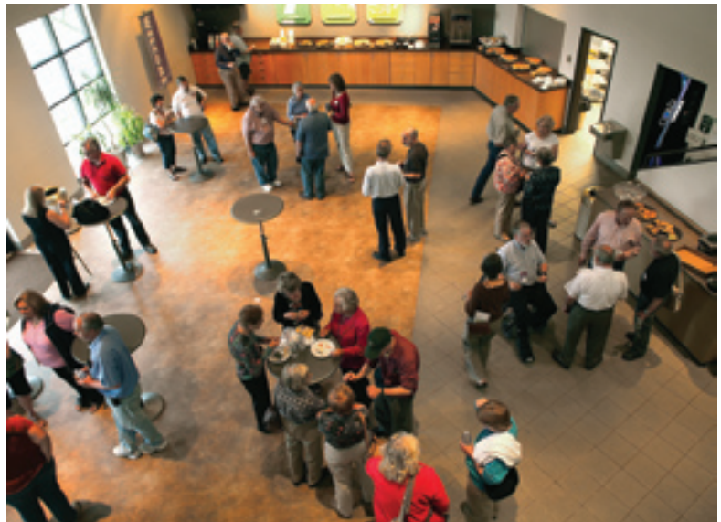
Attendees enjoying refreshments prior to the event.