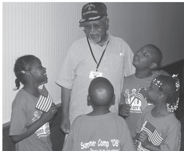
WWII Buffalo soldier talks to the First-Centenary UMC kids about their efforts. Jim Hyatt takes pictures and makes slide show in support of these kids from low income households.